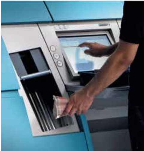
Left: Large Continuous Feeder (LCF)