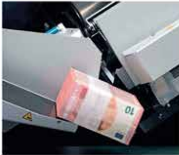
Top: output of bundle delivery modules

Productivity, flexibility, security: with impressive performance in every respect, the BPS M5 sets the technical standards in its class